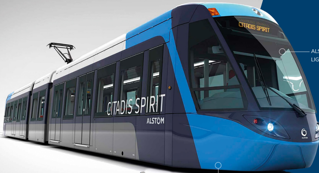
ALSTOM CITADIS SPIRIT LIGHT RAIL VEHICLE (LRV)