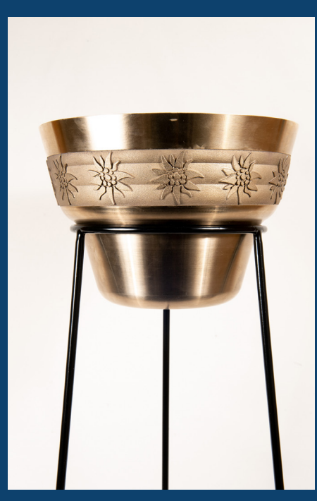
Fig. 01 - Bottle size bucket in Edelweiss design