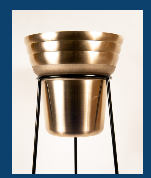
Fig. 02 - Magum size bucket in City design

The stand is made of handwrought iron in a blackened antique finish. Other patinas of the stand are available upon request.